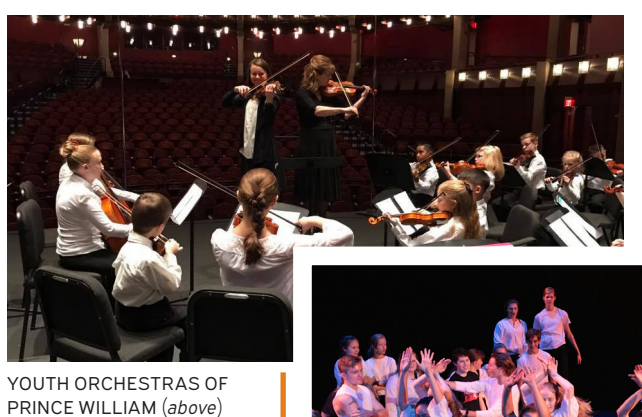
ARTfactory PIED PIPER THEATRE (below)